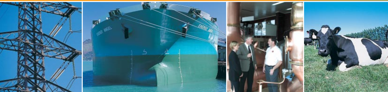
Left to right: Power lines; coal ship at Port of Lyttelton; Canterbury Brewery; dairying in the South Island.

timber and industrial processing are all expanding industries with growing energy demands. Many schools and hospitals rely on coal for a low cost, efficient overall source of heating and energy. Modern industrial boilers have advanced control systems that reduce emissions to very low levels.