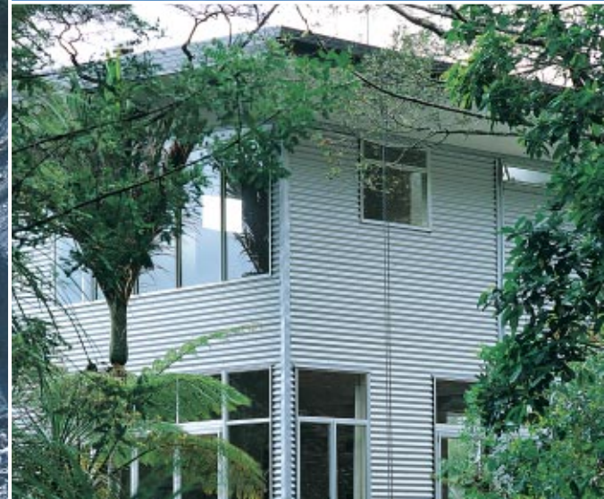
Left: Otira Viaduct, West Coast; Top right: Huntly Power Station; Bottom right: Steel building.